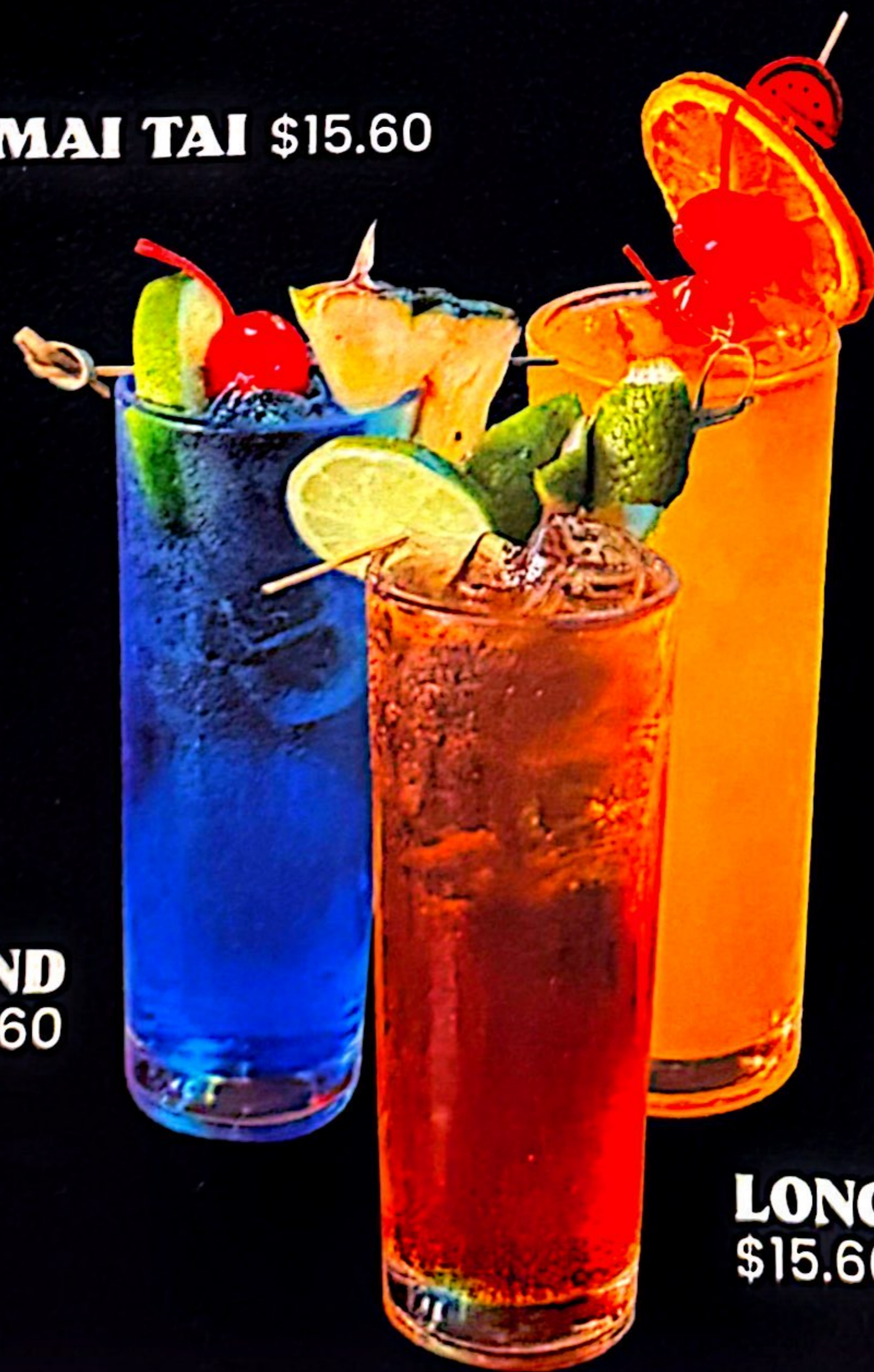
LONG ISLAND $15.60