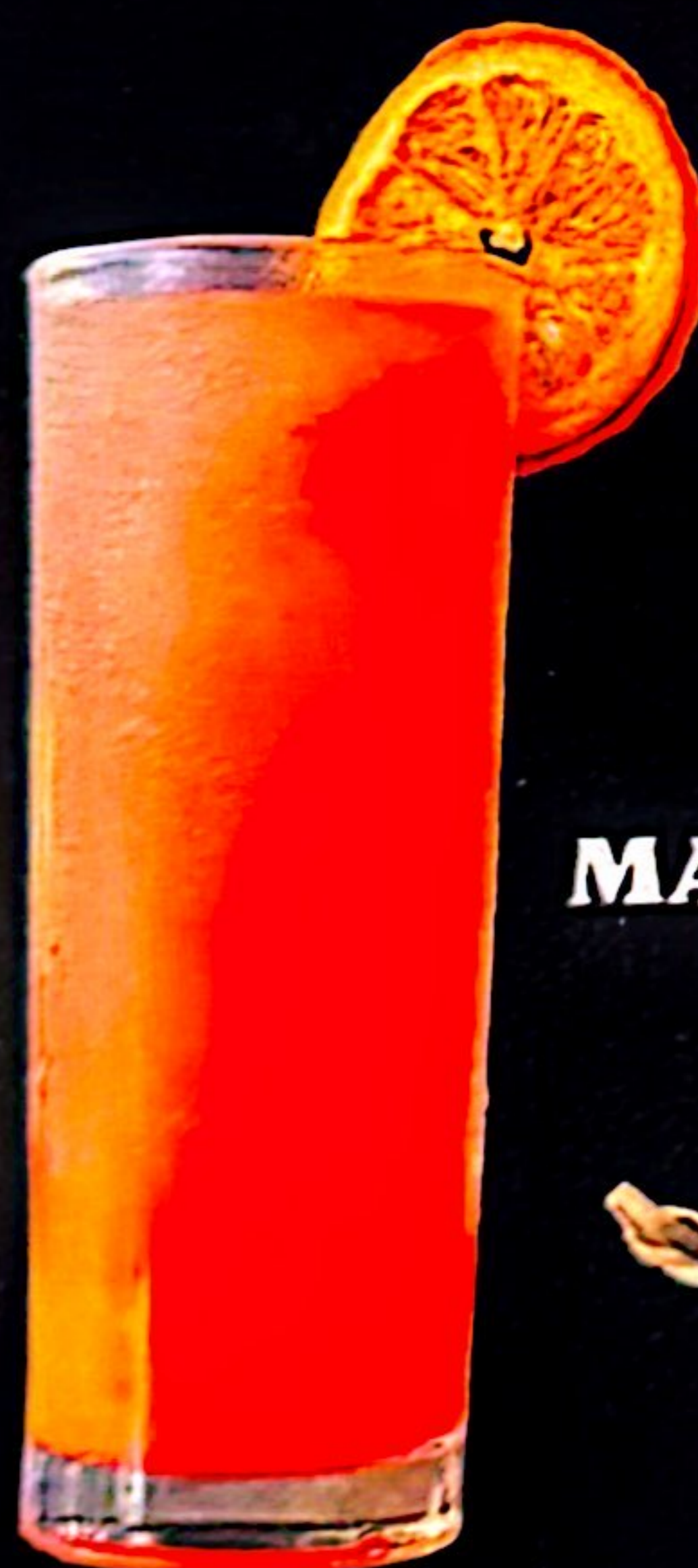
MAI TAI $15.60