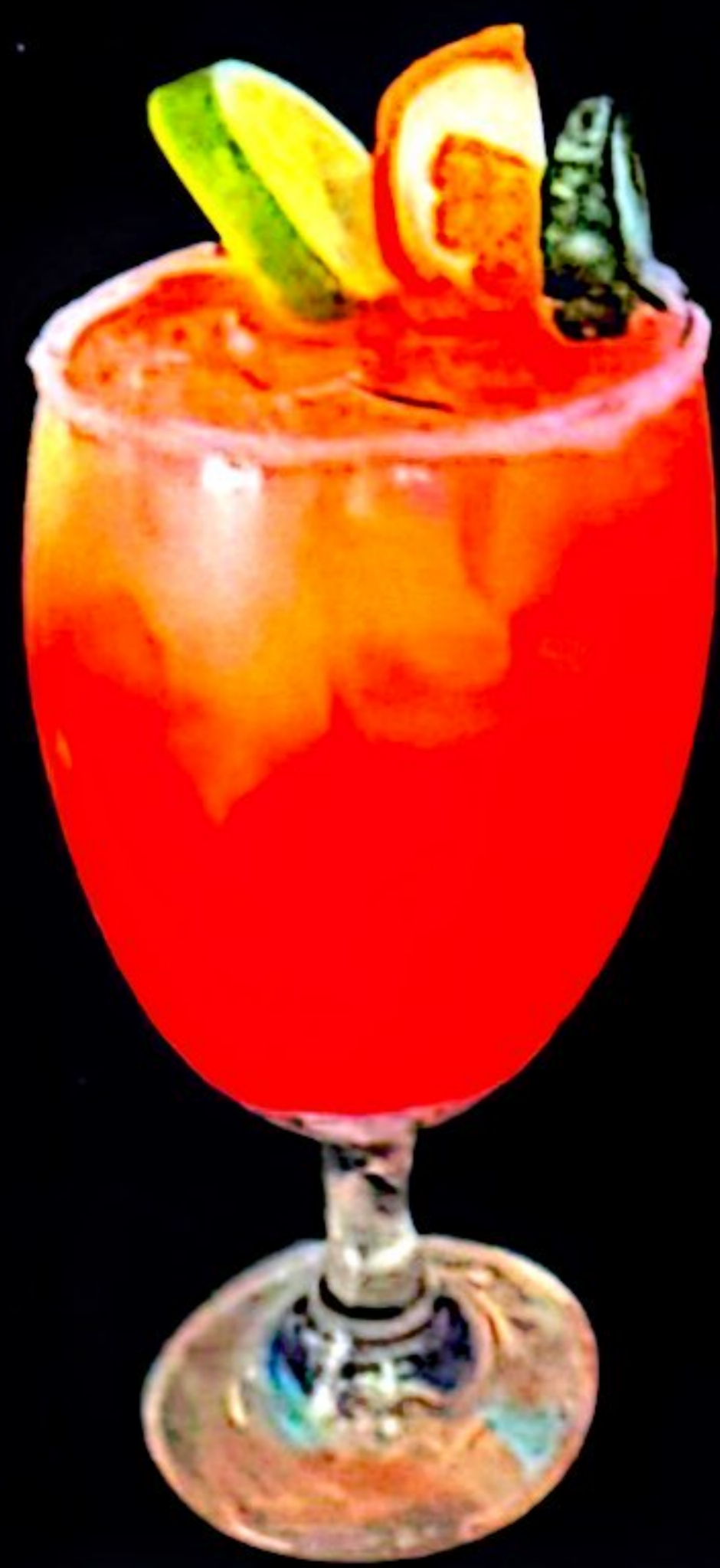
SPICY TEQUILA SUNRISE $15.60