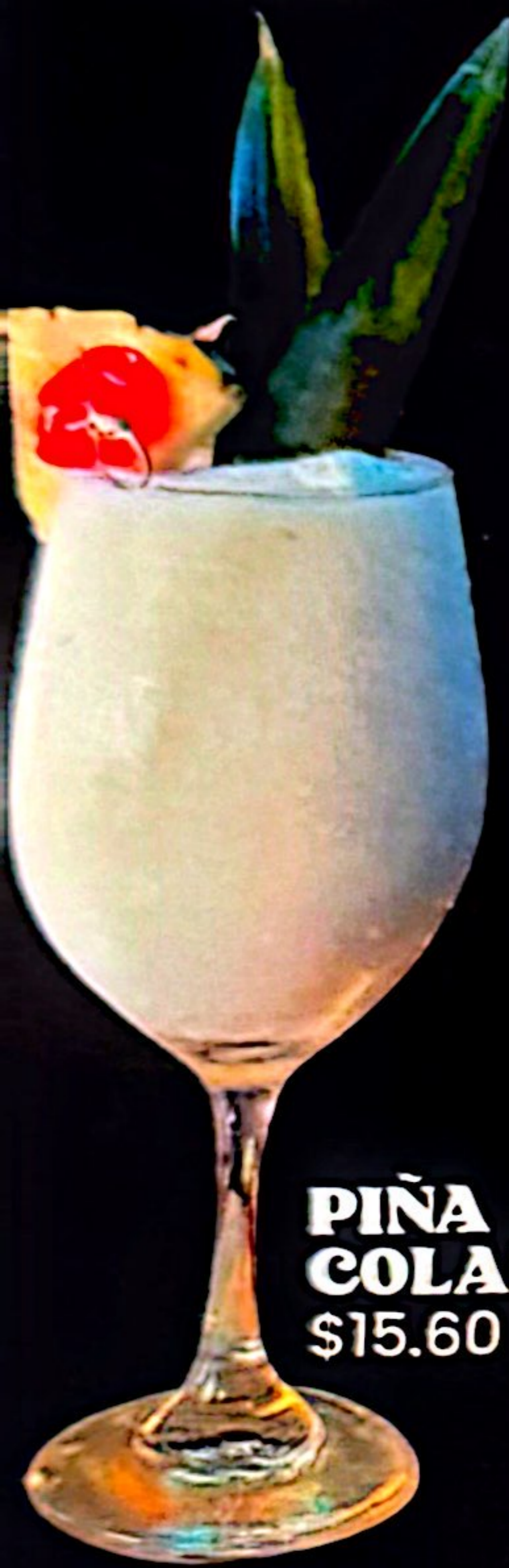
PIÑA COLADA $15.60