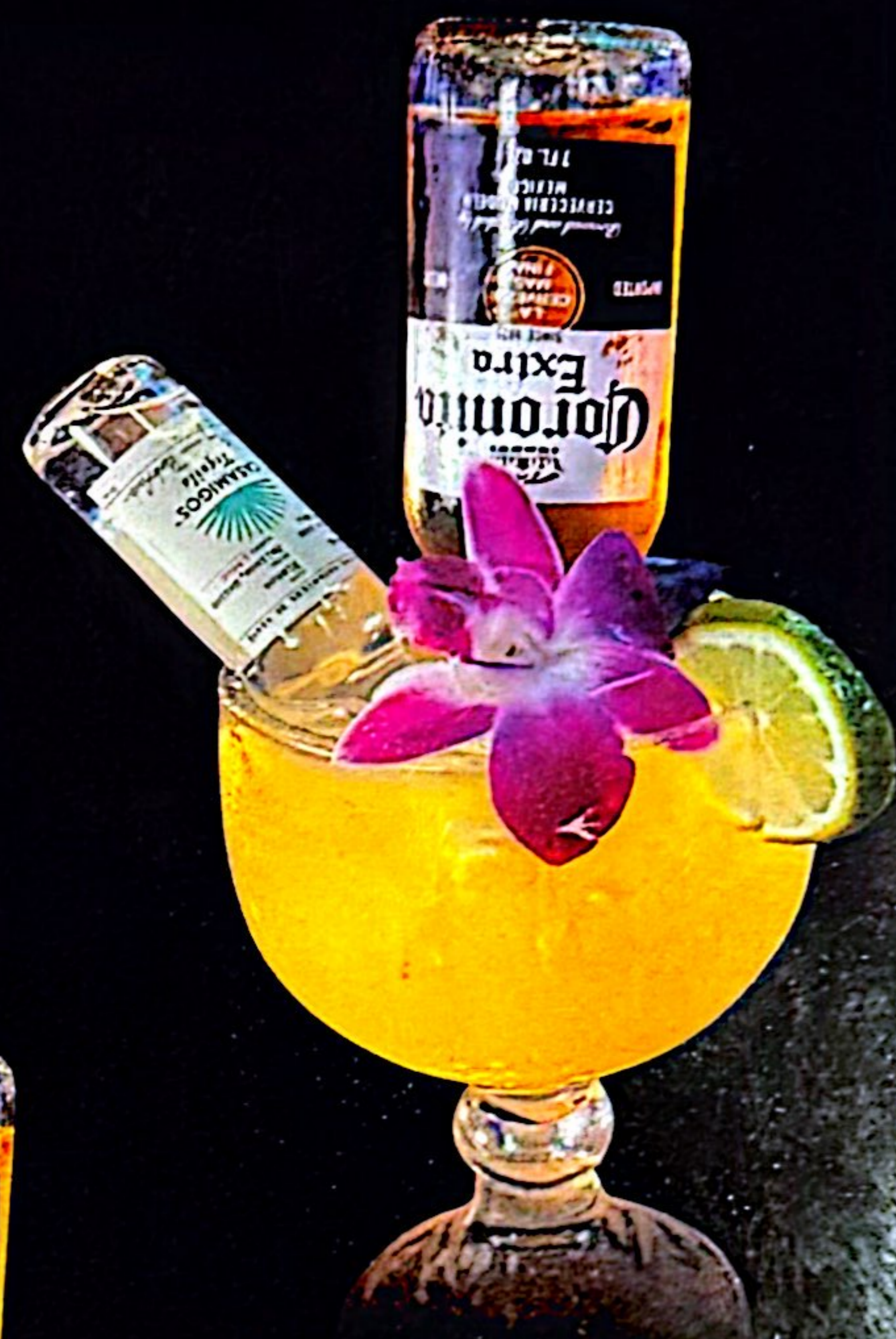
BULLDOG CORONARITA $36.40