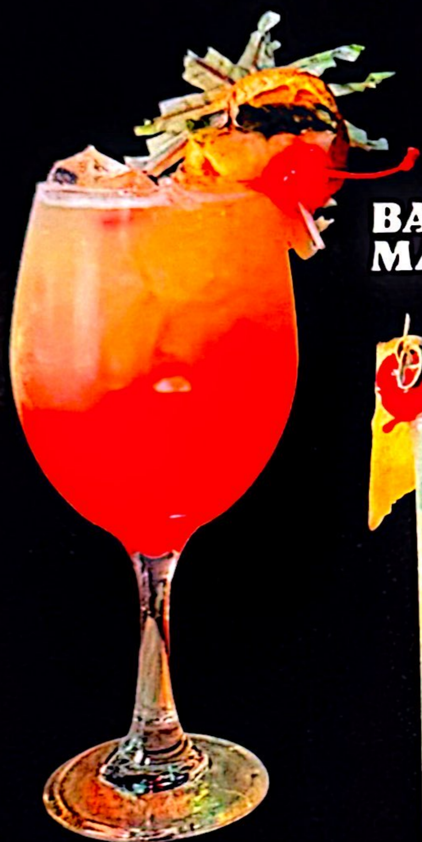
BAHAMA MAMA $15.60