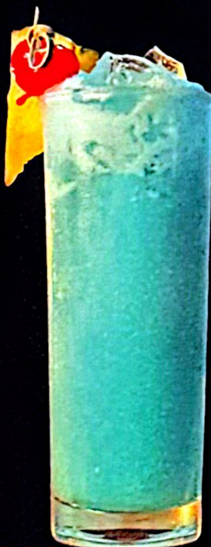
BLUE HAWAIIAN $15.60